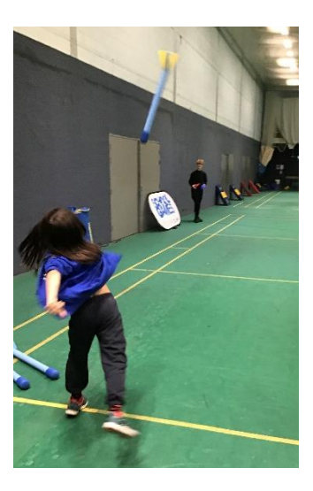
A huge thank you for all the adults who supported the school and made this trip possible!