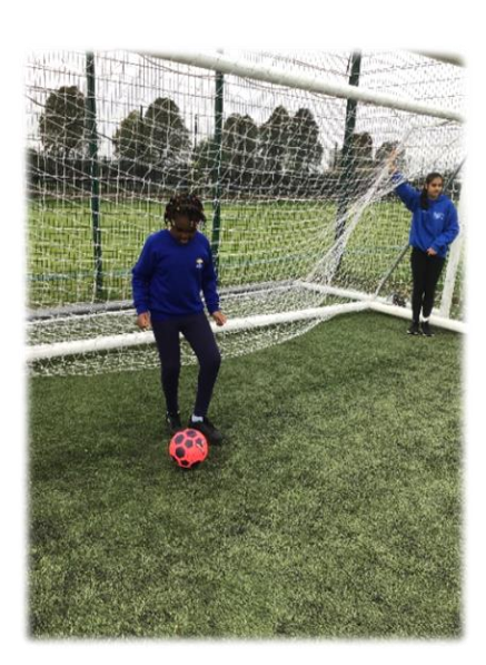
A huge thank you to all the adults who supported the school and made this trip possible!