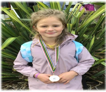
A huge thank you to all the adults who supported the school and made this trip possible!