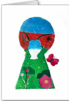
The Secret Garden

Through a series of engaging printmaking workshops, budding Year 6 artists produced a range of collagraph prints made from recycled materials.