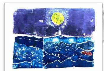
A Stormy Day at Sea