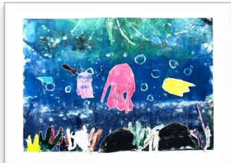
Under the Ocean

Buy a pack of these cards or a poster (or two, or three!) to support enriching activities for Barn Croft children.