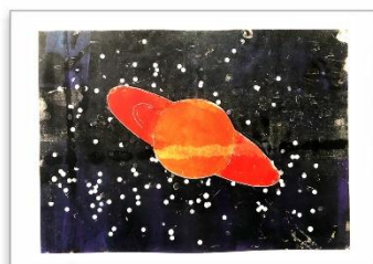
Under a Starry Sky