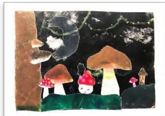
The Enchanted Forest